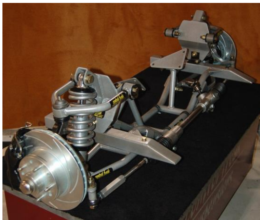
Independent Front Suspension Systems AMX, Javelin, Rebel, Ambassador, American, Spirit, Hornet, Gremlin, Concord, Machine, Marlin, Matador