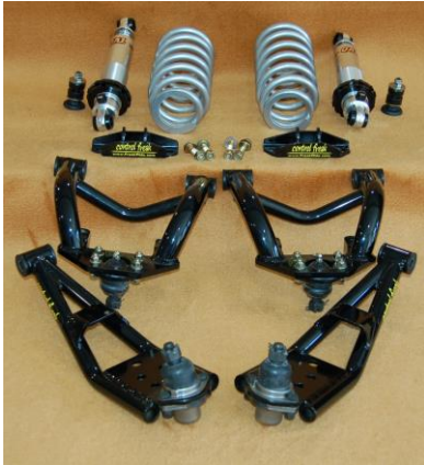
Coil-Over Conversion Kits AMX, Javelin, Spirit, Hornet, Gremlin & Concord