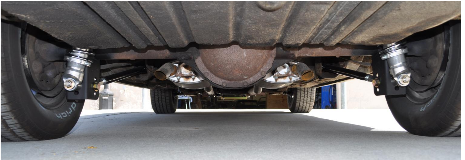
Rebel 4-Link Rear Suspension System (RS-1450)

control freak suspensions™ www.FreakRide.com