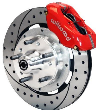
Brake Systems From Wilwood Engineering